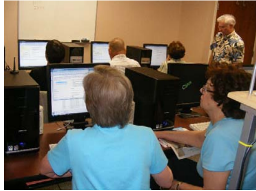
Ellicott City Senior Center's Computer Lab