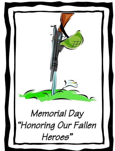
Memorial Day "Honoring Our Fallen Heroes"

Call CSA at 410/336-5878 for specific course information